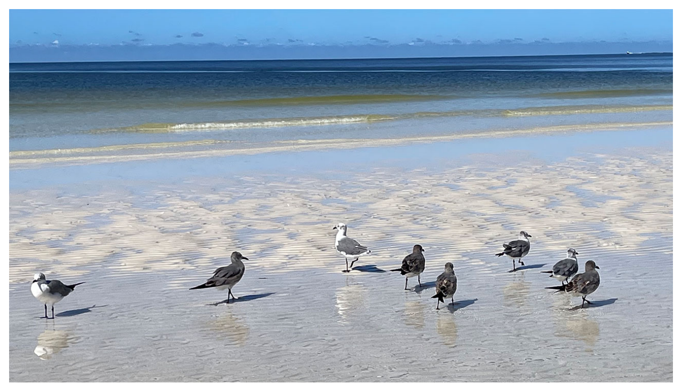
Calmness Before the Storm. A morning photo at the beach.

The ocean was exceptionally calm in the morning. We enjoyed a sunrise photoshoot one morning and were fortunate to experience a beautiful pastel sky. As the sun moved overhead, the waves became more substantial.