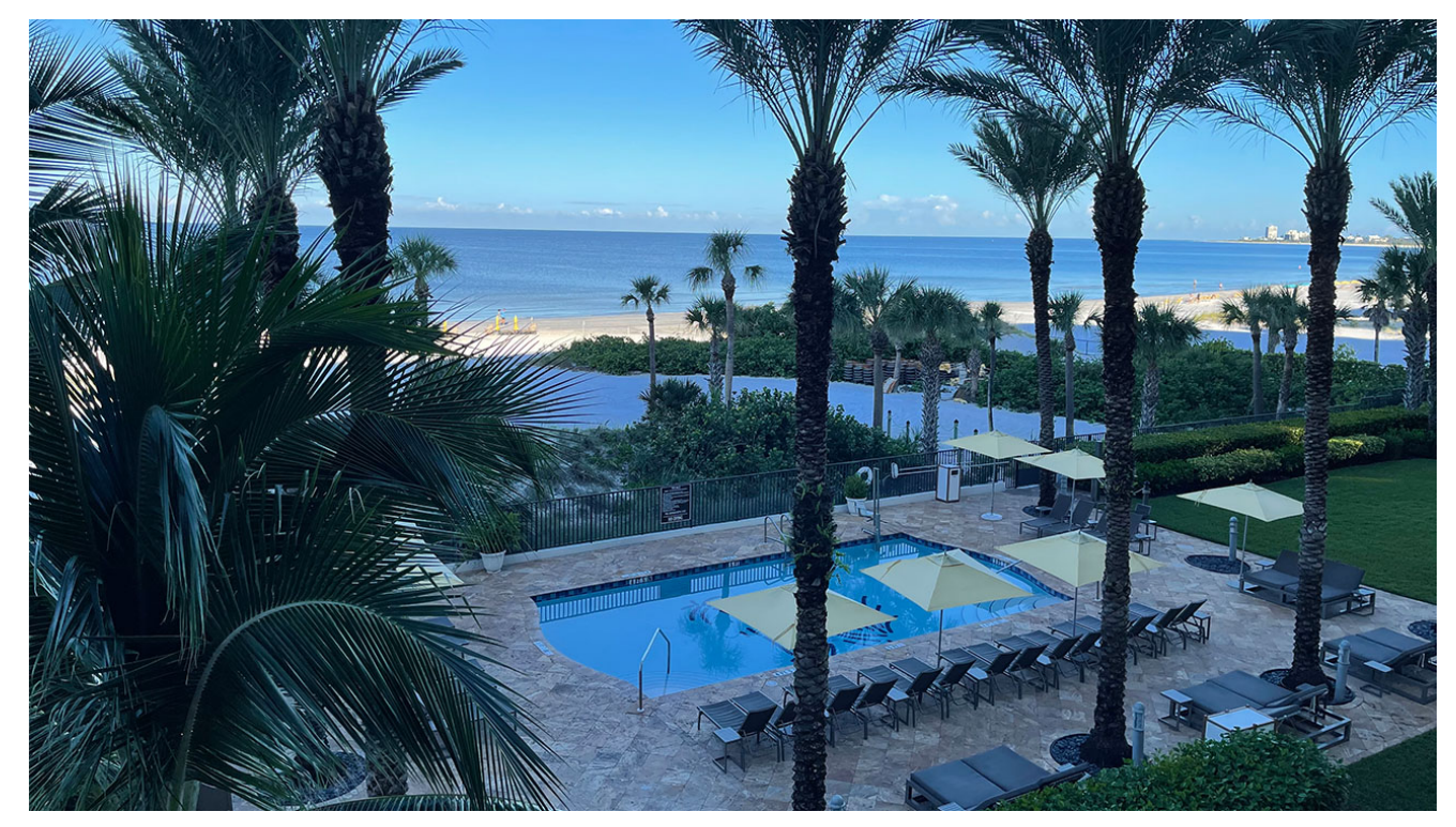
View From our Oceanfront Condo at Siesta Key Beach.

Before finalizing our plans, I asked my son if he was concerned about going to Florida during the hurricane season. He didn't anticipate an issue and suggested that I focus on the quality time that I would be spending with his young children. With reasonable rates and less crowds, it sounded ideal and worth the small risk.