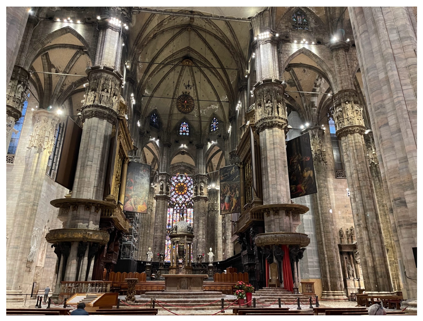
Inside Milan's Duomo Cathedral.