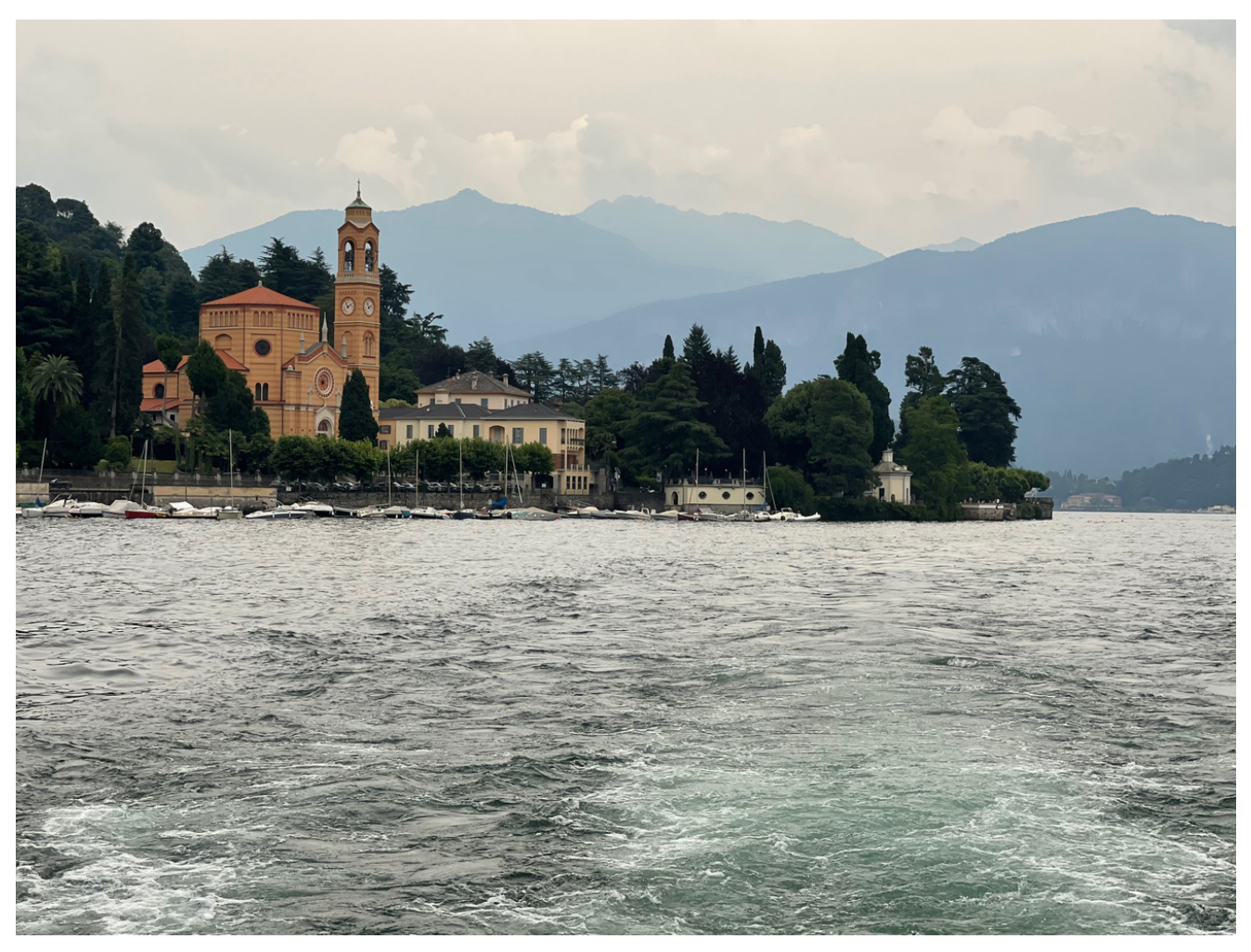
View from Lake Como Boat Ride.

Next, I headed to the nearby botanical garden gate. Due to a lack of time, I chose not to pay the entrance fee. Instead, I returned to the pier well ahead of the designated departure time.