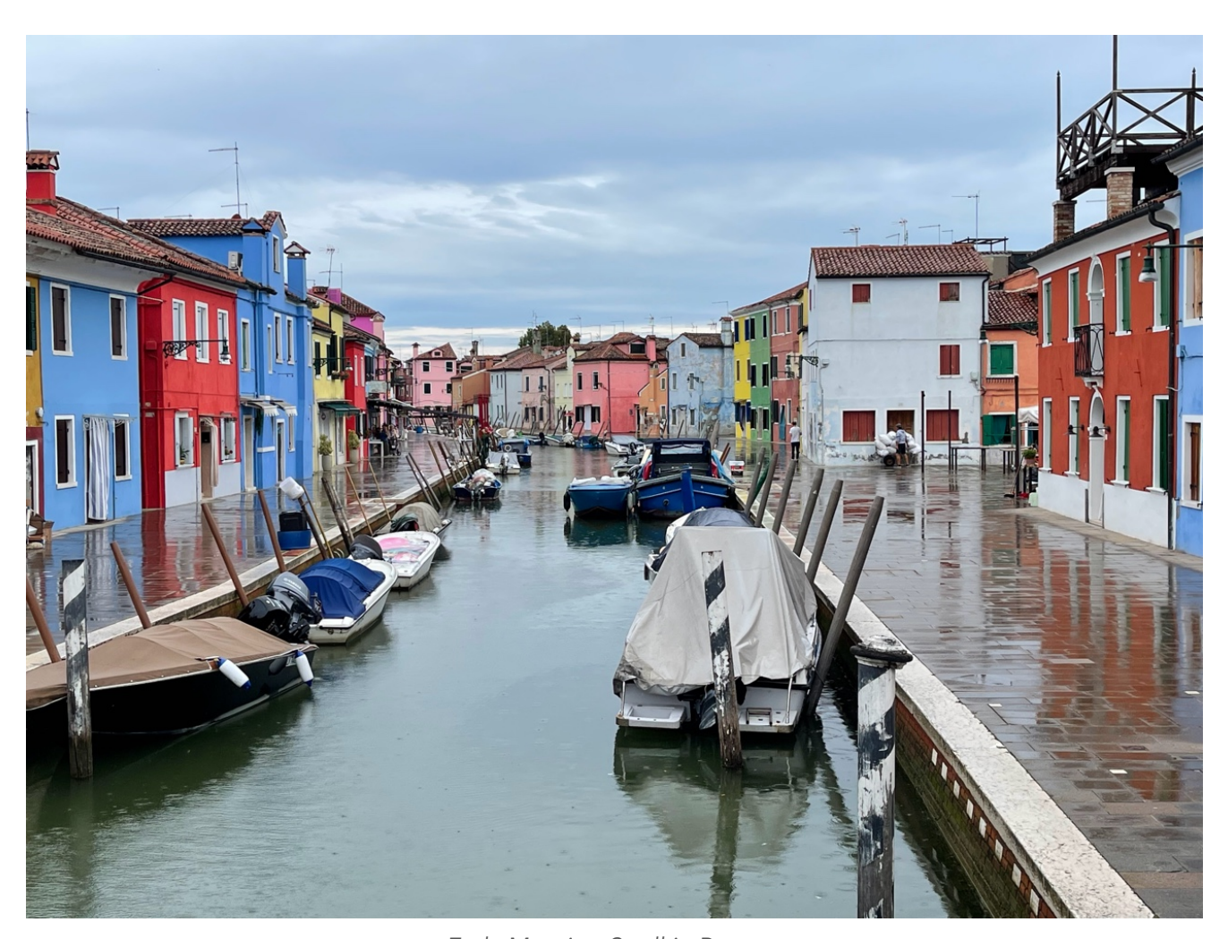
Early Morning Stroll in Burano.

The next morning, I scampered in and out of raindrops to take more pictures of this beautiful place before the crowds returned to shop. I opted not to take the short boat ride to Torcello for a morning tour of a cathedral with ancient mosaics.