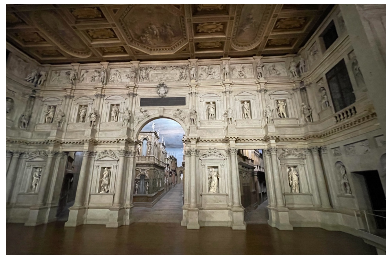
Inside Teatro Olimpico in Vincenza.

Most of my fellow cruise passengers spent their free time shopping for locally made items in the nearby open market and small boutique shops. I indulged in a leisurely Italian lunch at a local café with a fellow passenger.