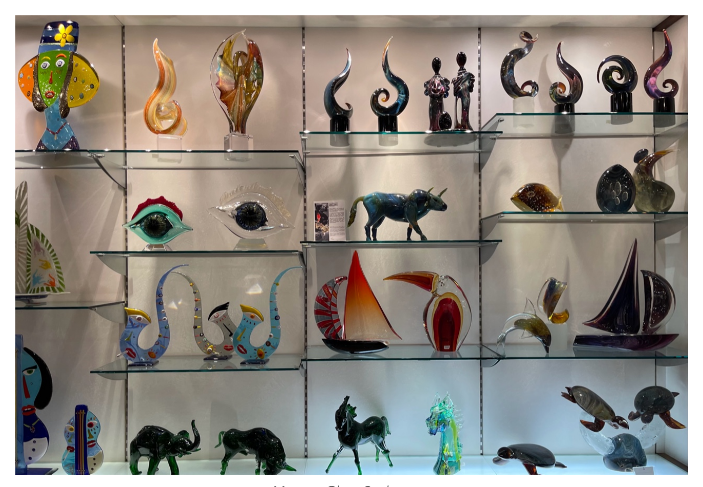
Murano Glass Sculptures.

After lunch, we sailed to Murano. Murano is well known for its handmade glass vessels, statues, and jewelry. Almost everyone returned to the boat with a special treasure.