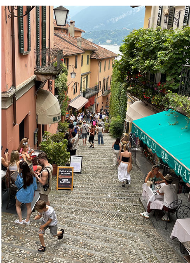
Left: Sandy Bornstein at Castello Sforzesco. Right: Looking Down from Bellagio Overlook.