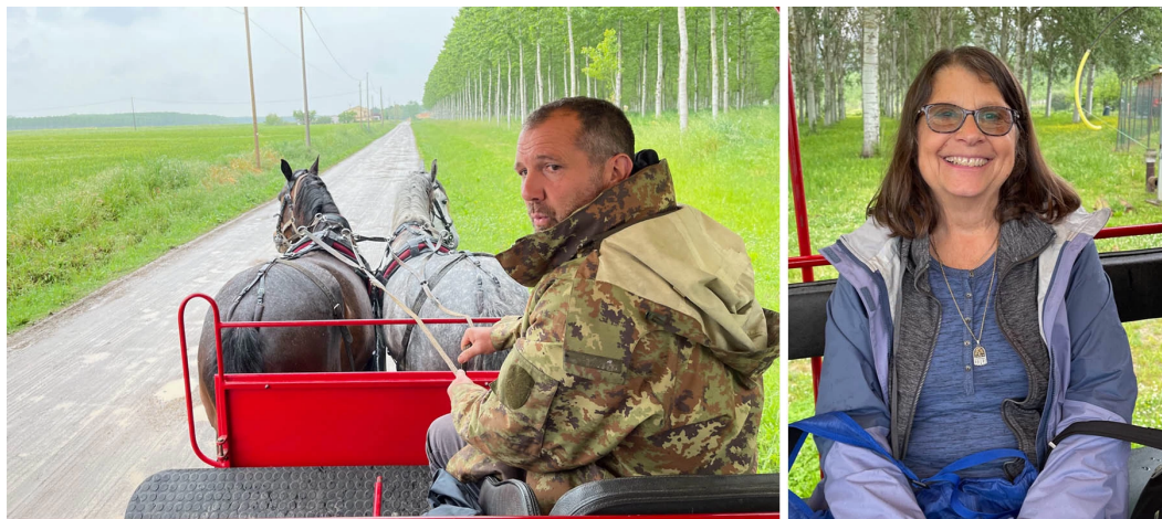
Left: Horse drawn carriage at the Vialot Farm, a Tuscan Farmhouse Experience.

zippered hoody, along with a waterproof rain jacket and KÜHL blue jeans.