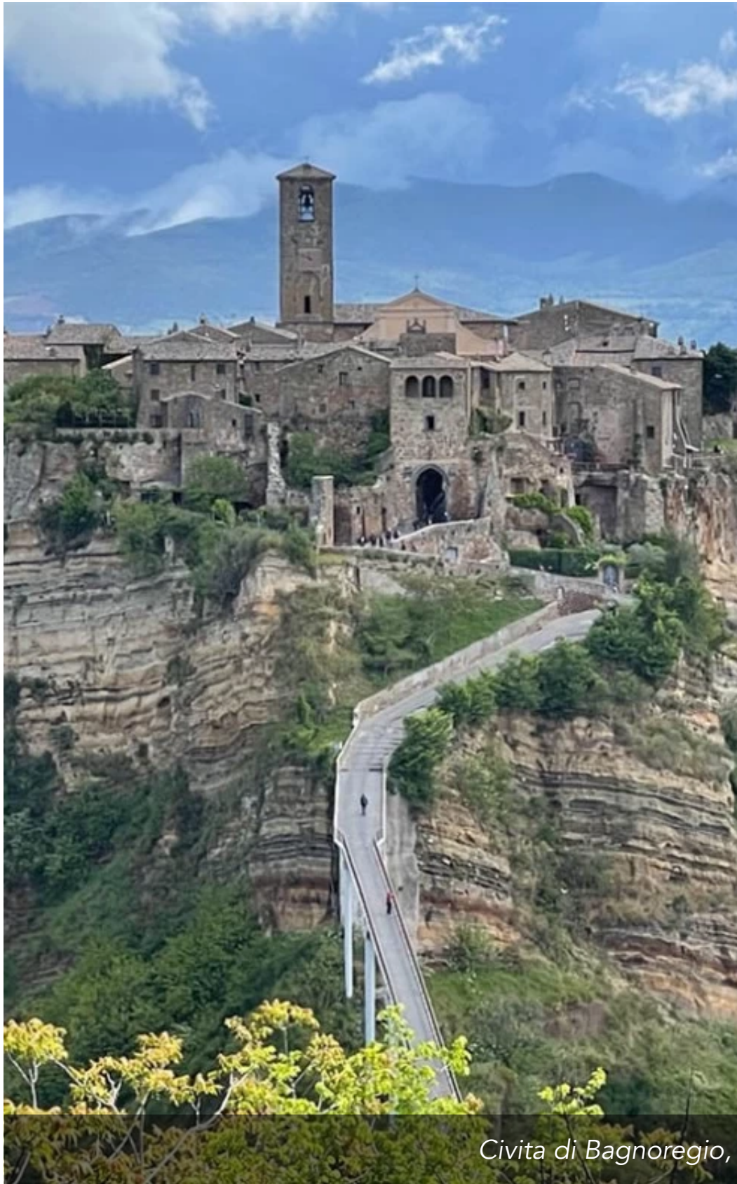
Civita di Bagnoregio,