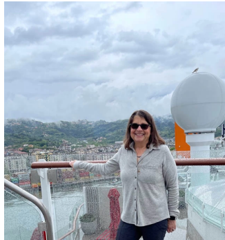
Aboard the Celebrity Ascent.