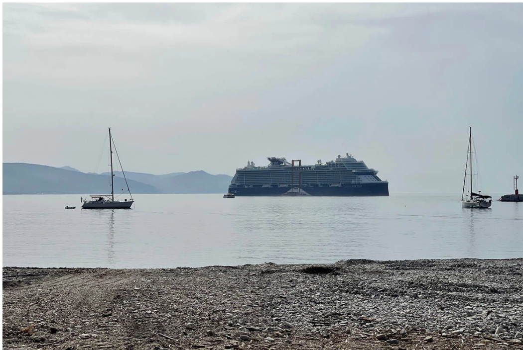
Celebrity Ascent off the Coast of Santa Margherita, Italy.