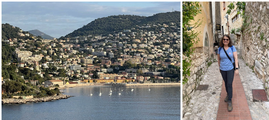
Left: Mediterranean Cruise Off the Coast of Villefranche, France. Right: Exploring the Pedestrian Walkways in Eze, France.

stores. Since time was limited, I was unable to visit the nearby perfume factories. To accommodate my ability to easily walk up and down cobblestone stairs and walkways, I chose a pant that had flexibility. My Skulpt Skinny pants in charcoal and a light blue top were a wise selection.