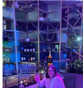
Eden Bar aboard the Celebrity Ascent.