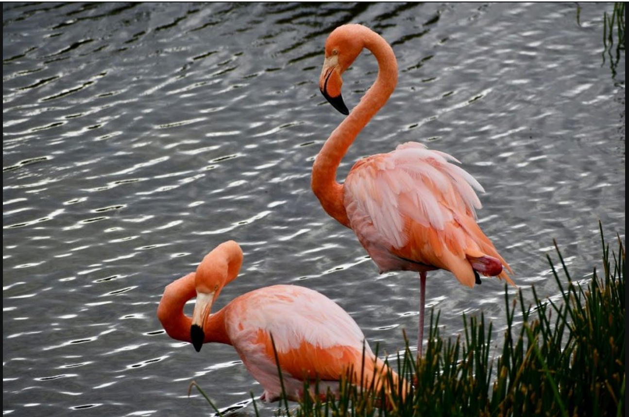
Flamingoes, Isabela Island, Galapagos Islands

Surprisingly, patches of resilient greenery survived on this island that looked dramatically different from the other islands that we had seen. Most notable were the mangrove shrubs that thrived along the banks of the lagoons, Galapagos carpetweed, and succulent plants with white and yellow flowers.