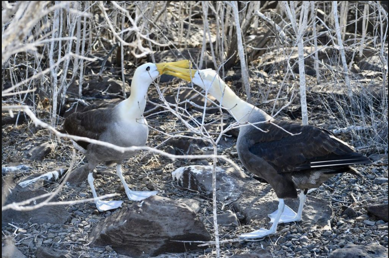
Waved Albatrosses perform mating ritual, Gardner Bay, Galapagos Islands

In a field full of brown volcanic boulders, everyone was speechless as two waved albatross waddled on their large webbed feet toward one another. Their heads moved from side to side as they strutted forward. They used their notable yellow peaks to perform a mating ritual by hitting their beaks together and then stopping to make a notable sound. Usually, this ritual is performed at the beginning of the mating season. Our guide pointed out that these mature wave albatrosses were renewing or revitalizing their relationship before they departed. We were lucky to see this performance because the waved albatrosses inhabit this island only from April to December.