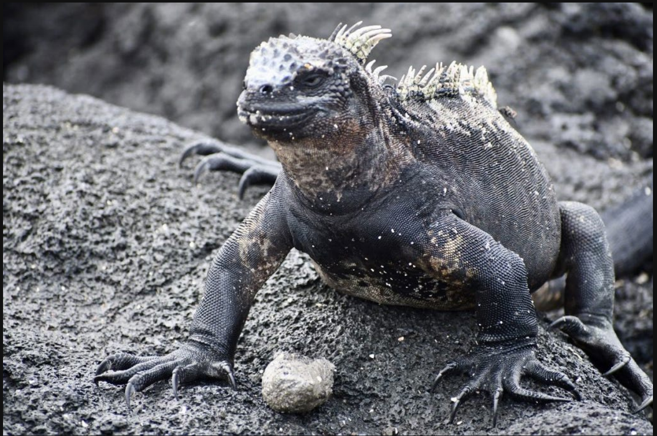
Marine Iguana, Fernandina Lava Field, Galapagos Islands

assortment of colorful shells, barnacles, and a handful of sea urchins scattered here and there.