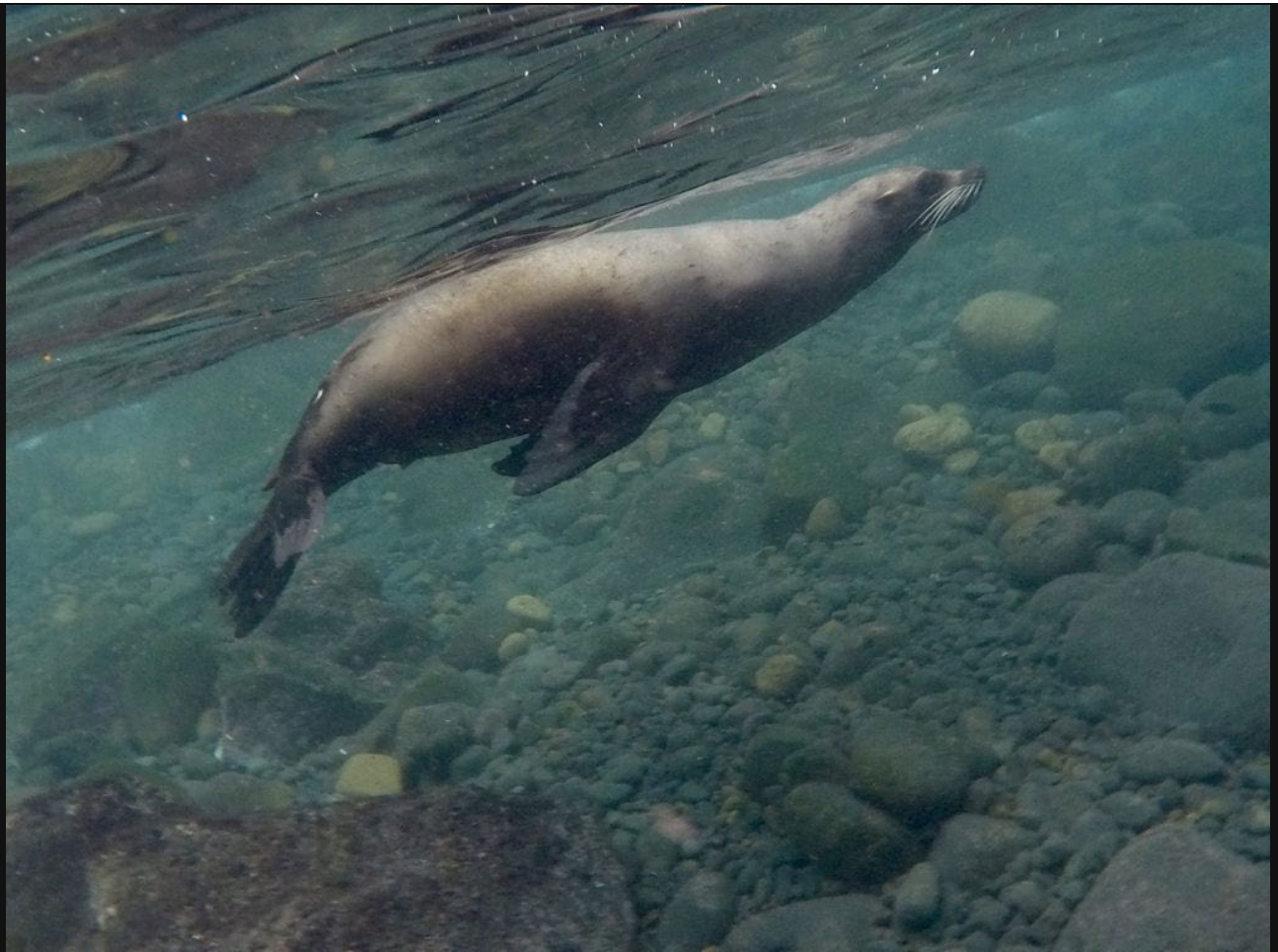
Sea Lion, Vicente Roca Cove, Galapagos Island