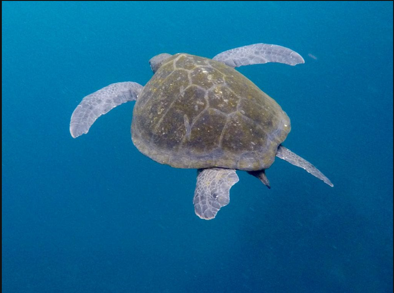
Sea Turtle, Vincente Roca Cove, Galapagos Islands

The best part of the day was our final snorkeling excursion. After entering the water from the zodiac, we swam along the rocky shoreline until a designated point. Sea lions or possibly Galapagos fur seals approached us as if we were long lost friends. Pacific green sea turtles came uncomfortably close and then headed to the sandy ocean floor. My heart beat faster as I responded to this incredible interaction with marine life.