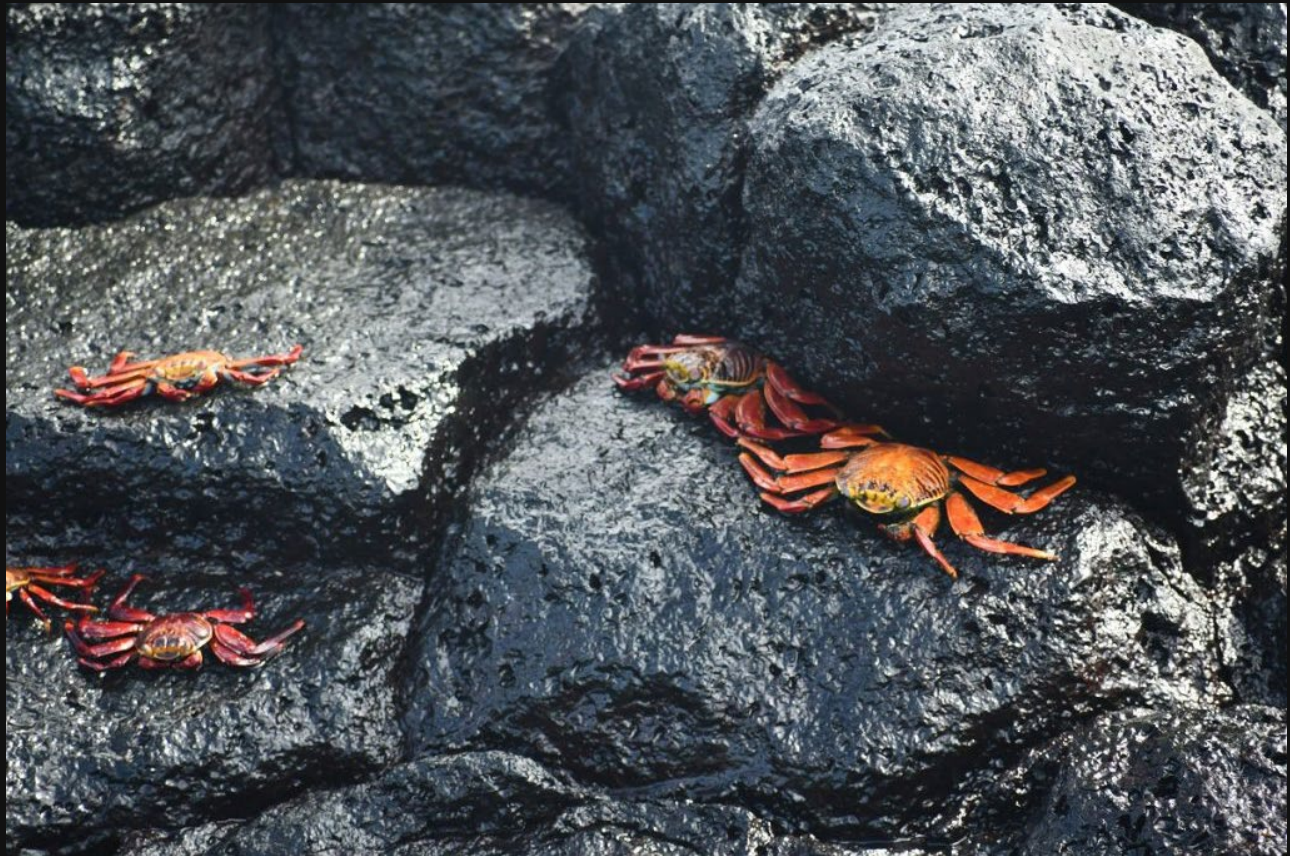
Crabs skitter over rocks, Post Office Bay

The zodiac drivers adeptly maneuvered the boats so that everyone had a chance to snap photos, but maintained a safe distance from the few sea turtles that could easily be mistaken for pieces of driftwood.