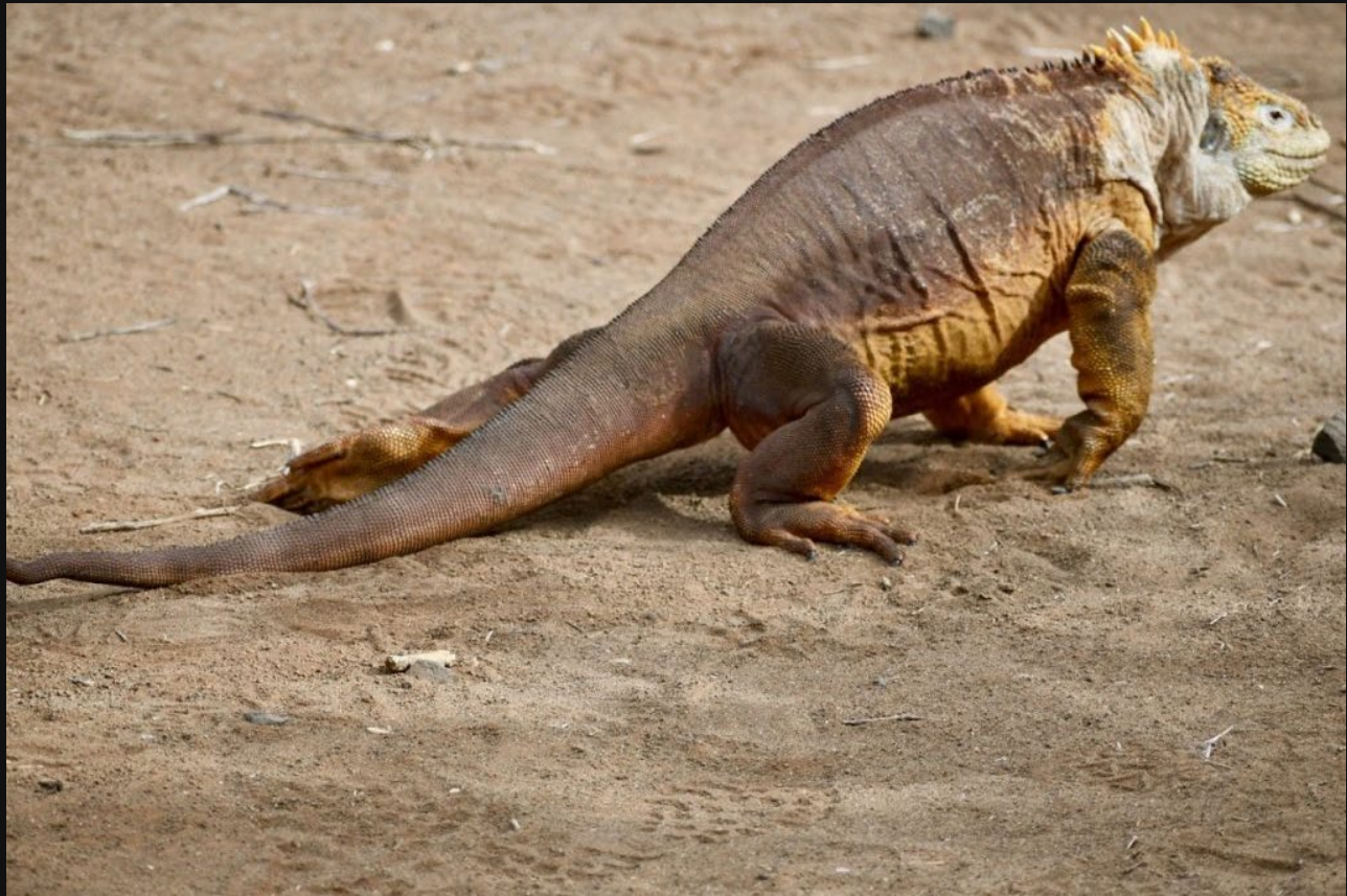
Land Iguana, Dragon Hill, Santa Cruz Island

Along the way, the Galapagos land iguanas lay motionless as finches and mockingbirds skipped along on the arid terrain, and yellow warblers flew overhead. Goats, pigs, and dogs once threatened this indigenous population of iguanas until the Charles Darwin Foundation stepped in.