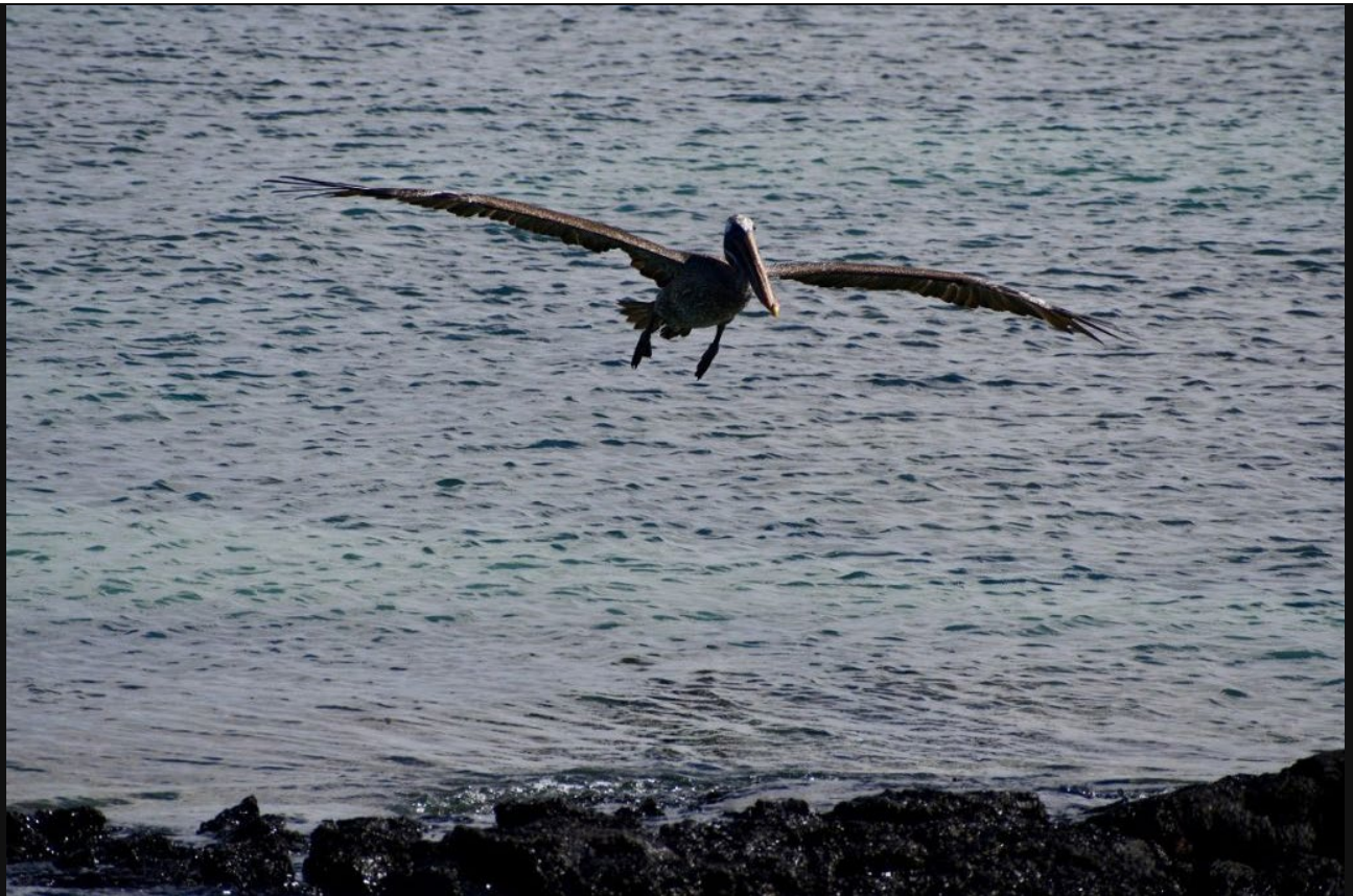
Pelican in flight, Isabela Island