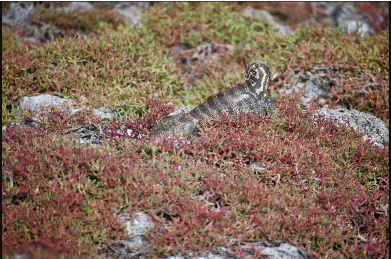
Hybrid Iguana, South Plaza, Galapagos Islands

As waves crashed against the weathered coastline, swallow-tailed gulls, red-billed tropic birds, Nazca boobies, and blue-footed boobies graced the skies and landed in nests or on nearby cliffs. We had to watch where we stepped because smelly sea lion poop was everywhere.