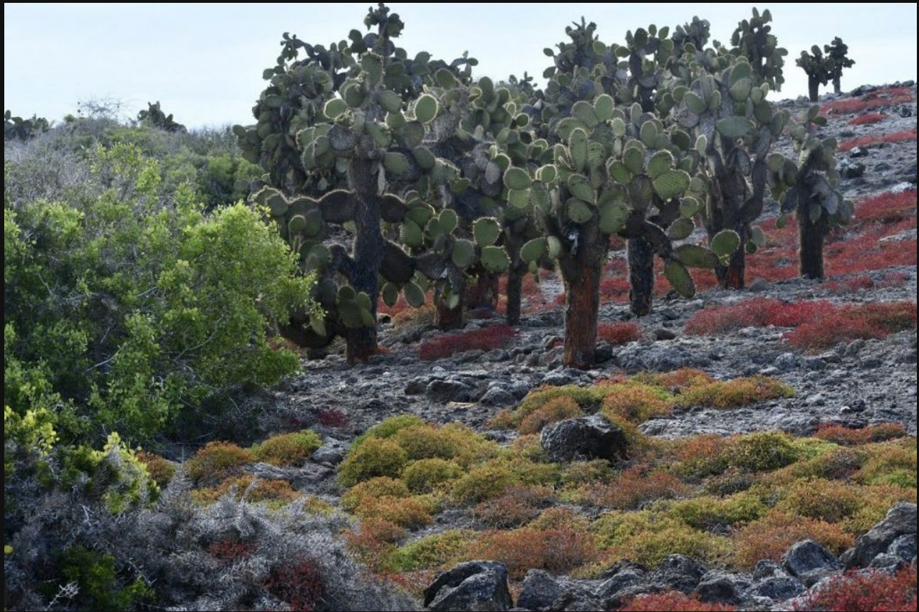
Colorful South Plaza landscape, Galapagos Islands

South Plaza is just east of Santa Cruz. It is a small, narrow island frequently noted for its crimson, orange, yellow, and green carpet of succulent plants called sesuvium. In December, this color combination is similar to autumn colors found in a deciduous Northern Hemisphere forest. Towering over this picturesque carpet were intermittently spaced prickly pear cactus trees with yellow flowers.