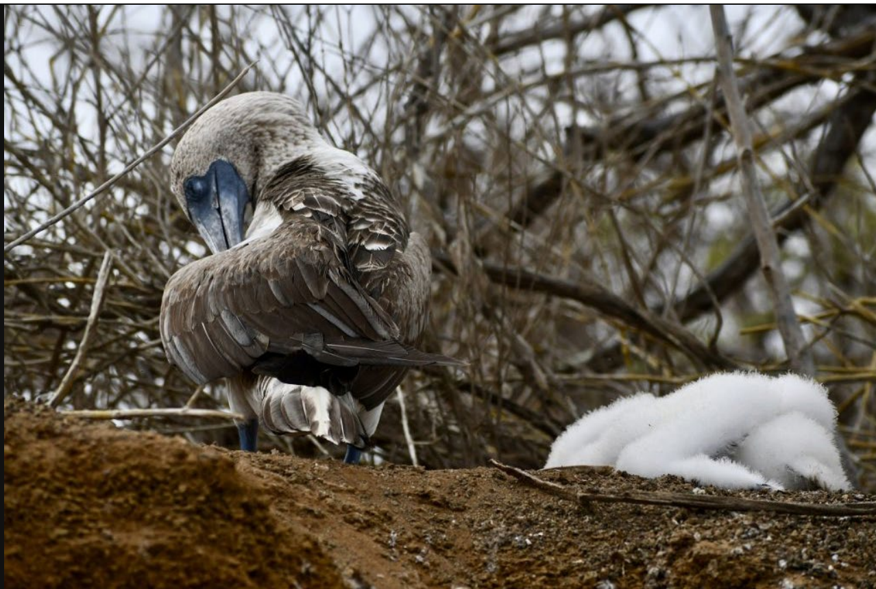
Mother Blue Footed Booby and Baby