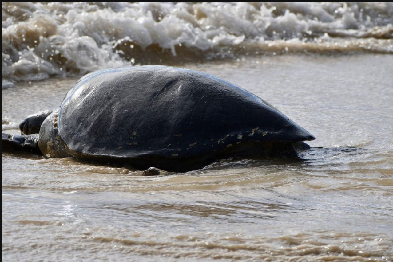
Pacific SeaTurtle, Punta Cormorant, Floreana Island

On another part of the island, we walked down a gravel path toward a secluded organic beach. At first, we didn't see any wildlife. We just enjoyed the excellent view of the rhythmic ebb and flow of the sea touching the beach. Several green Pacific sea turtles were spotted a few yards in the water. For a short while, one swam close to the shoreline. His large shell was about all we could see. His head and legs were indistinguishable.