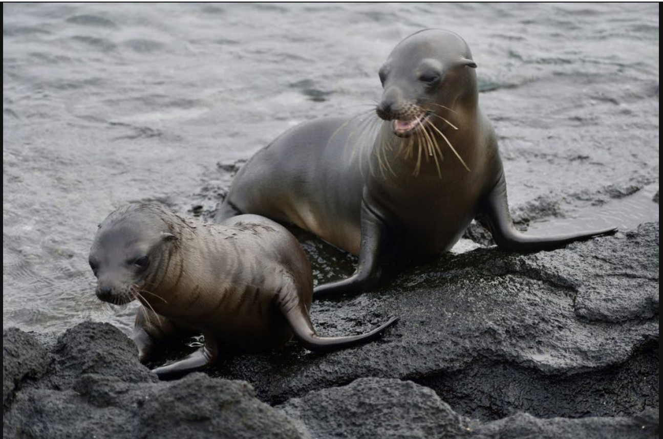
Mother & Baby Sea Lions, Fernandina Lava Field, Galapagos Islands

A Galapagos hawk stood guard at a nearby tree while flightless cormorants were off in the distance near waves crashing against small rock formations.