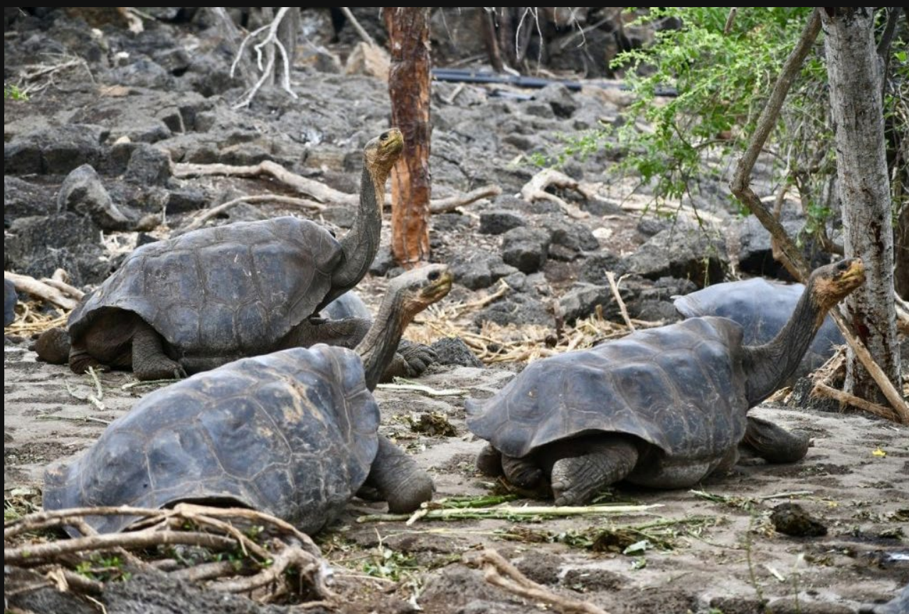
Giant Tortoises, Galapagos Tortoise Breeding Center and Charles Darwin Research Center

The giant tortoise population was severely depleted by sailors, pirates, whalers, and buccaneers who would take tortoises to be used as food on long voyages as well as by countless others who extracted the tortoise's oil for lamps and used their shells for a variety of purposes. Outsiders wreaked havoc with the tortoise population by introducing pigs, rats, goat, and non-indigenous plants into the environment. It is estimated that only 10% of the original population lives on the archipelago today.