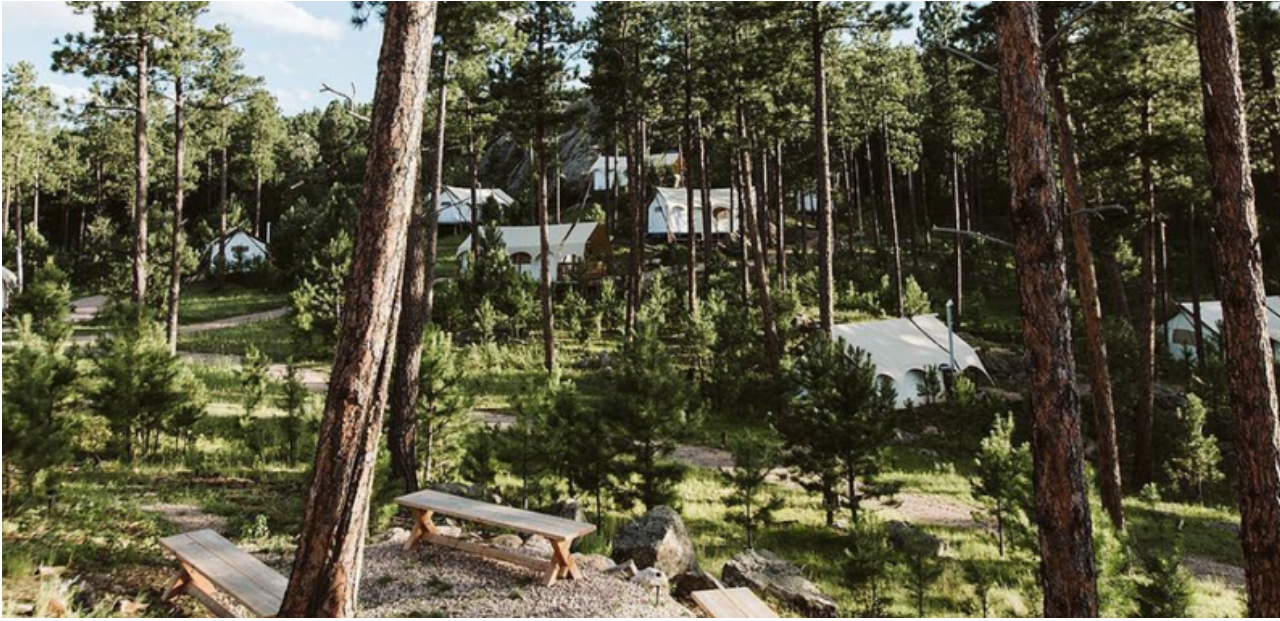
The newly opened camp site at Mount Rushmore.

Vacation properties that are located in key places add value to the overall travel experience. Being close to main attractions and having spectacular views are two top priorities.