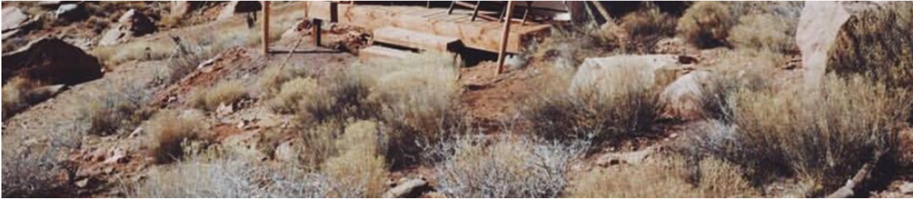
The Zion campsite.

With a limited amount of space, it's always best to pack light. To be adequately prepared for the conditions, check the upcoming weather report. The region is known for extremes in temperature and plentiful summertime rain.