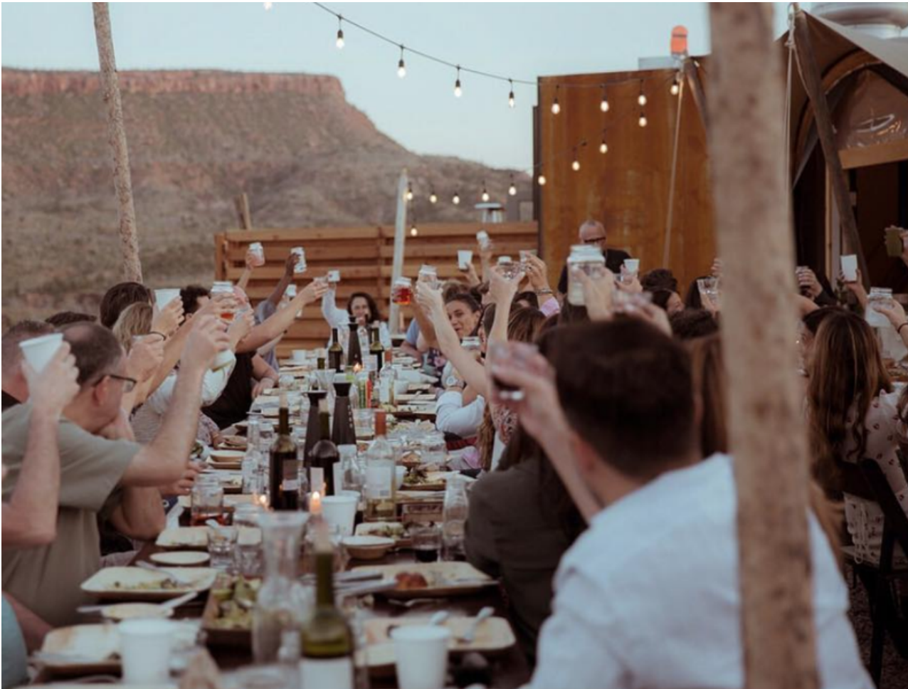
A dinner celebration at the Zion National Park Under Canvas site.

Breakfast and dinner are labeled as “fast casual dining.” Some opt for a leisurely breakfast while others take breakfast on the go. Lunch sacks can be ordered