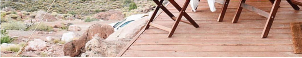
Porch side at Zion National Park. Under Canvass / Instagram

The Mount Rushmore location appeals to families, multi-generational families, couples, and groups of like-minded individuals. The facility has cribs, pack n' plays, and camp cots with sleeping bags.