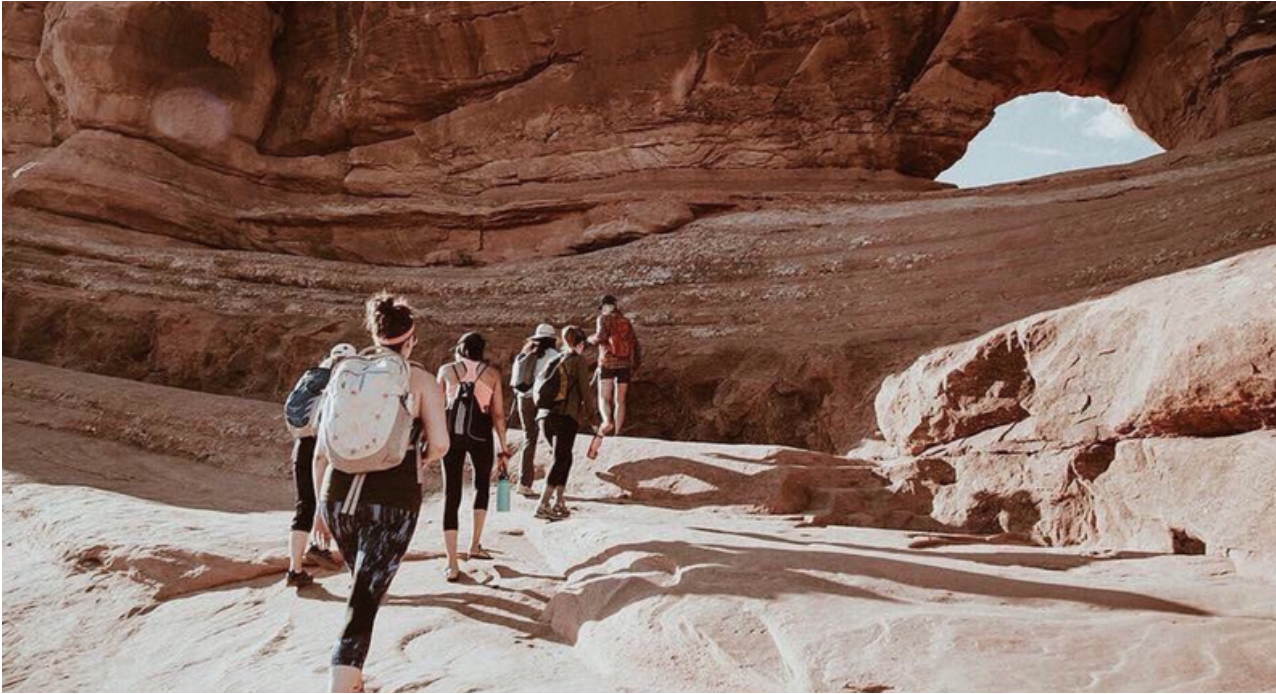
A Under Canvas Moab day hike.

Daily activities are arranged by Under Canvas' skilled coordinators to meet the individual needs of its guests. To avoid disappointment, it's advisable to book several weeks in advance of arrival.