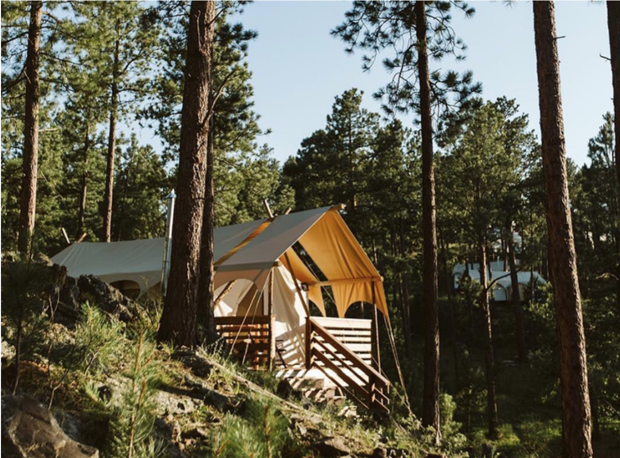
Under Canvas Mount Rushmore was designed to blend in with the landscape.

Under Canvas Mount Rushmore was designed with a minimal footprint.