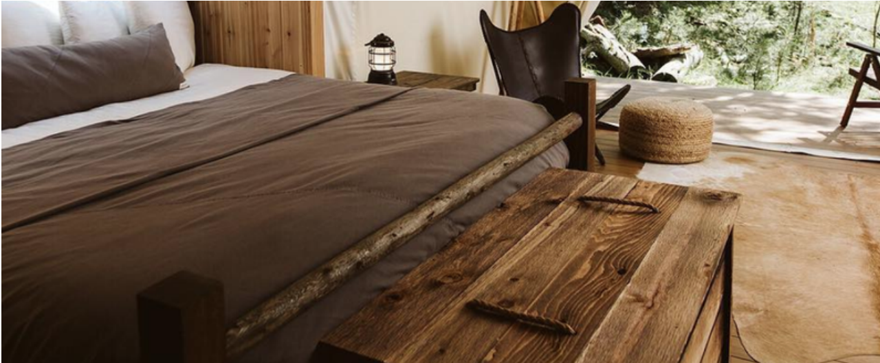
A tent interior at the Mount Rushmore site.

This glamping site has a variety of luxury tent options. Safari tents have king size beds and wood burning stoves. The wood burning stoves and chopped wood will come in handy during the cooler evenings.