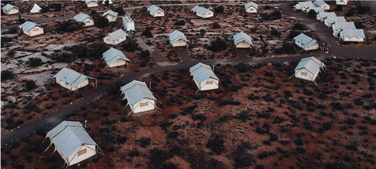
Under Canvas, now encompassing seven locations, was launched in 2009, modeled their all-inclusive glamping adventures after an African safari experience. Pictured is Moab's site.

Under Canvas Mount Rushmore was created to serve affluent travelers desiring sensational views of these presidential faces from the luxury of a well-appointed tent community. These deluxe accommodations are part of the Under Canvas brand that was launched in 2009 by Sarah and Jacob Duskek. The Duseks modeled their all-inclusive glamping adventures after an African safari experience.