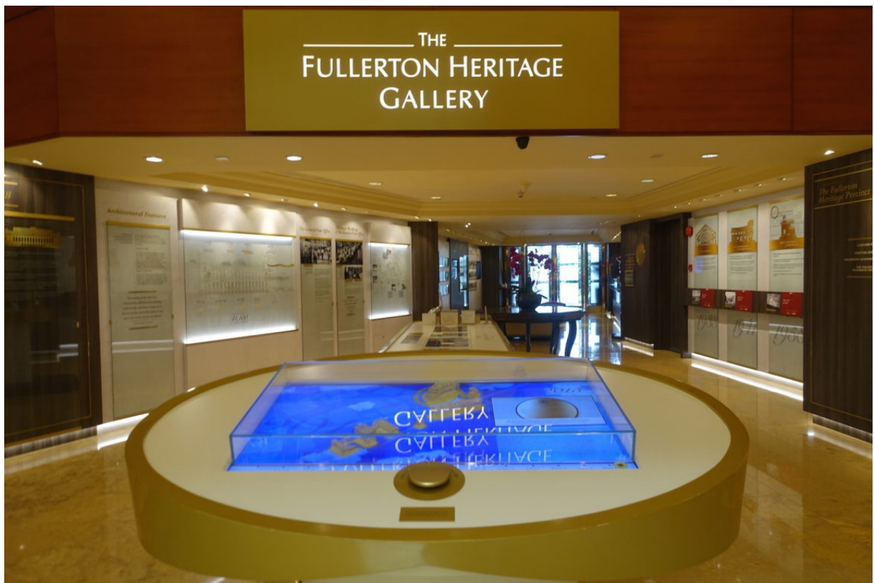
Fullerton Heritage Gallery in Singapore

Another great spot is the Fullerton Hotel Singapore, which used to be a general post office. I was surprised to find a small collection of artifacts in the Fullerton Heritage Gallery. As I walked toward the Asian Civilisations Museum, I passed by the National Gallery Singapore, Victoria Theatre & Victoria Concert Hall, and the Old Parliament House. All of the buildings have very interesting backstories, which is why I couldn't wait to snap a few photos.