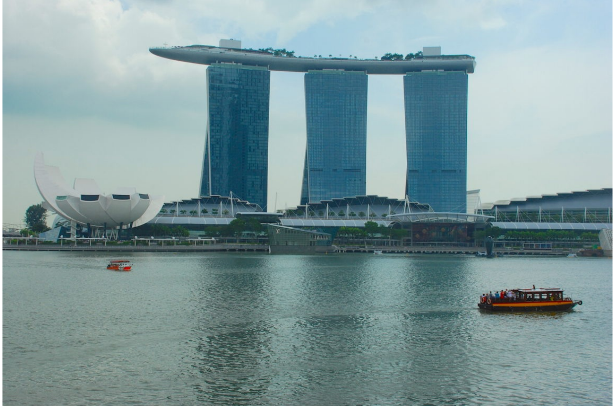
Wide view of Marina Bay Sands in Singapore

On my way to Gardens by the Bay, I passed by the Helix Bridge, a 280 meters waterfront promenade. Rain forced me into nearby Marina Bay Sands. While I had not intended on stopping at this iconic location, I was impressed with the number of restaurants and shops inside. I passed the time by dining on local cuisine in a lobby restaurant. The pricey SkyPark Observation Deck offers great photo opportunities on non-cloudy days.