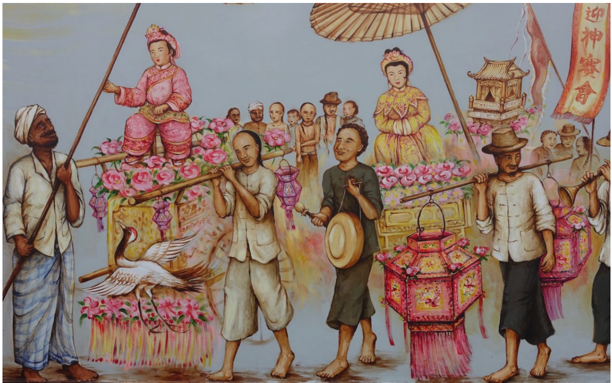
Chinatown Mural in Singapore

In the early 19th century, Sir Thomas Stamford Raffles, a British East Indian administrator and the founder of Singapore, designated an area for Chinese immigrants that became known as Chinatown. To pinpoint some key attractions, I picked up a “Footprints of Our Forefathers” map at the Chinatown Visitor Centre. The map recommended a number of historical places and activities including the Buddha Tooth Relic Temple and Museum, a walk up Ann Siang Hill, the Thian Hock Keng Temple and Mural, and a short rest at the Telok Ayer Green. I managed to do it all in one day.