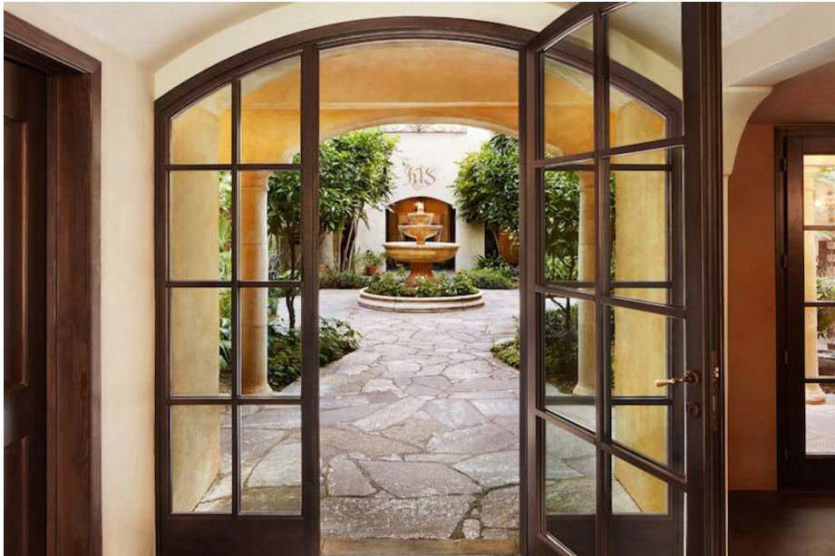
Courtyard fountain at Kenwood Inn & Spa

We entered our spacious room with soft music playing in the background. A romantic fireplace sat across from the featherbed and a marble bathroom with a soaking tub and oversized shower was down a short hallway. Freshly baked cookies in a cellophane bag along with a chilled bottle of Segura Viudas Brut, a Spanish sparkling wine, were a wonderful finishing touch.