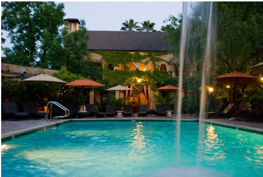
An inviting pool

Each morning, guests can stroll to La Cucina for a complimentary breakfast buffet from 8:00 a.m. to 10 a.m. They can choose from indoor and outdoor sitting. On chilly mornings, some guests position themselves near the outdoor fireplaces in the main courtyard while others find a comfortable place near the buffet line inside. All breakfast items are made fresh each morning including two cooked dishes, homemade yogurt, and baked goods.