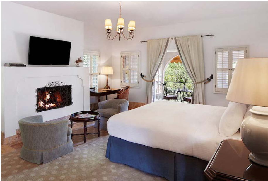
Garden view king room at Kenwood Inn & Spa

Sitting on 2-1/2 acres, Kenwood Inn & Spa is surrounded by mature oak trees, vineyards, and orchards. Even though the property has only 29 guest rooms and suites, its landscaped courtyards with blooming flowers and flowing fountains create a more spacious atmosphere.