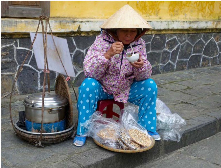
Woman eating in Ha Long, Vietnam

To maximize our time in this beautiful place, we spent two days and one night on a small boat operated by Paradise Cruises , joining people from around the world. At a leisurely pace, we visited the Luon Cave, Sung Sot Cave, and Tiv Tov Island, and also participated in a hands-on cooking demonstration, ate several regional meals and had a sunrise lesson in Tai Chi. Only a handful of people from our ship chose this pricey shore excursion.