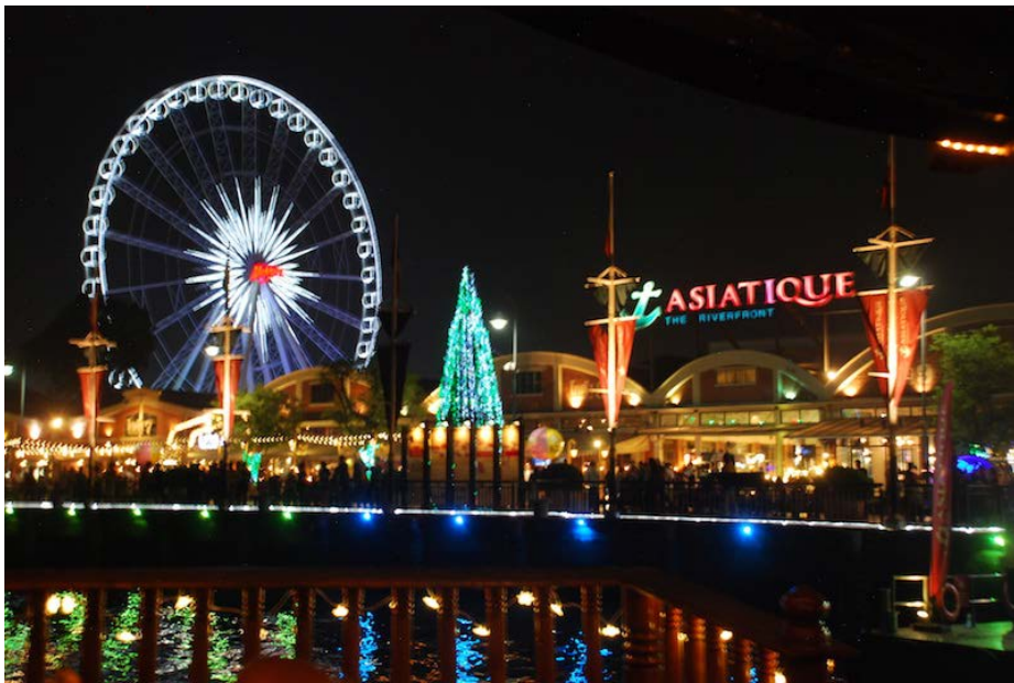
Bangkok at night viewed from a dinner boat