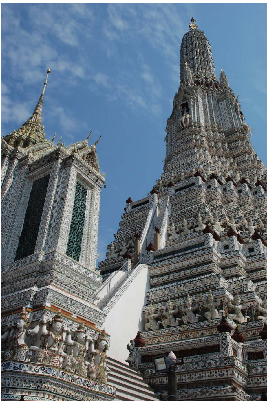
Wat Arun or Temple of Dawn in Bangkok

attractions. We were thrilled that we had maximized our short time in Bangkok by paying extra to book a multi-day shore excursion.