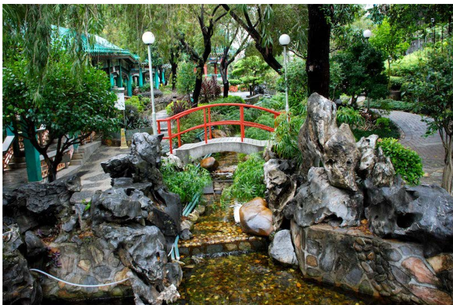
Good Wish Garden at Wong Tai Sin Temple in Hong Kong

options in the Club Lounge. Since we adore Asian food, I reserved a spot at the Hong Kong Foodie Tasting Tour that doubled as a tour of Hong Kong (we arranged this independently prior to the cruise). While my diet prevented me from trying some foods, I did indulge in, among other things, a dim sum feast at Dim Sum Square and nibbled on an egg tart at the Hei Lee Cake Shop. The dim sum entrees were freshly prepared and the egg tart was a welcome sweet treat at the end of a walking tour.