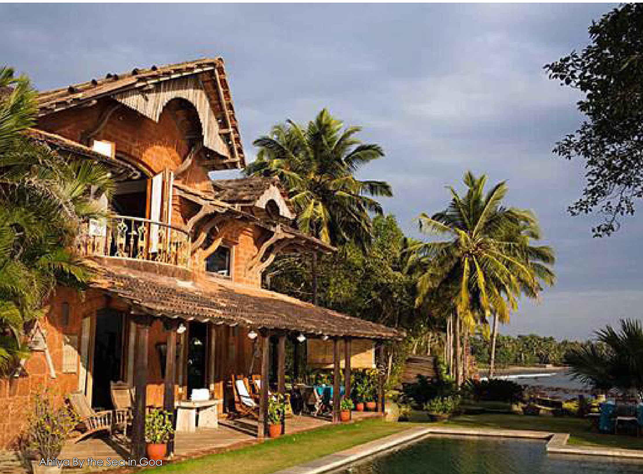
Ahilya By the Sea in Goa

Traveling with a baby in arms requires extra planning. Add grandparents to the mix and the overall situation becomes a bit easier for the parents. Sprinkle in an international destination and everything is up for grabs. Yes, intergenerational travel with a baby can be a whirlwind event, but at the same time a memorable experience for all.